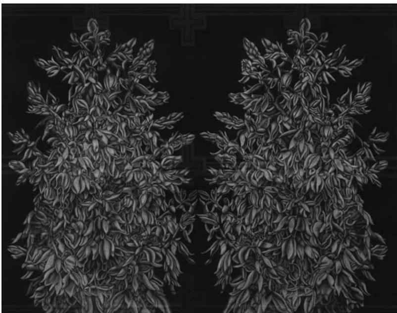
ANNUNCIATION, MIXED MEDIA, 36 x 46"