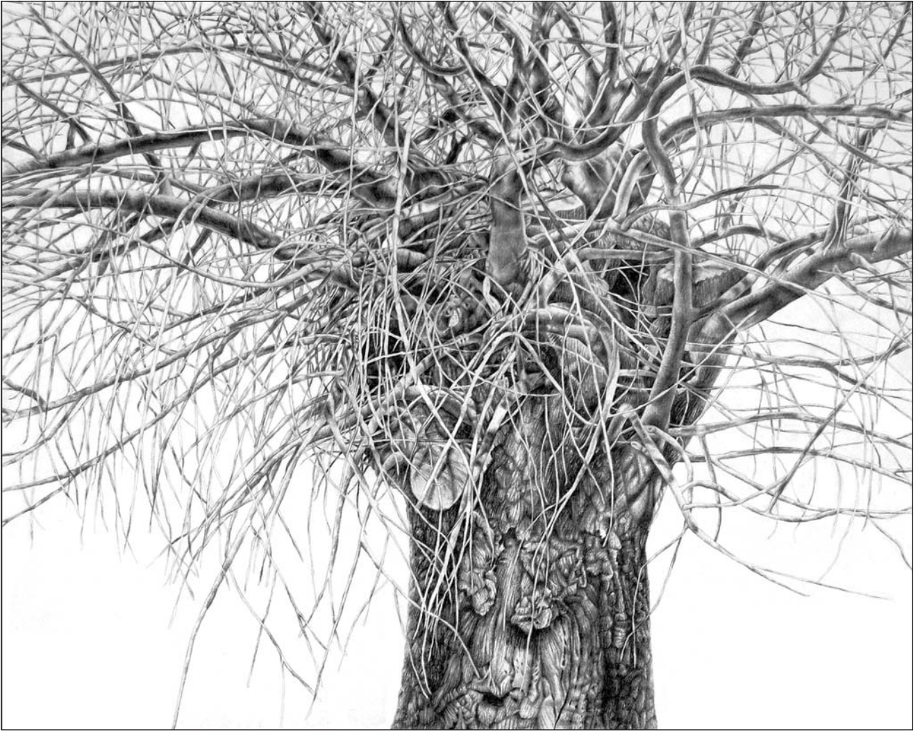
TRUCHAS, GRAPHITE ON PANEL, 48 X 60"