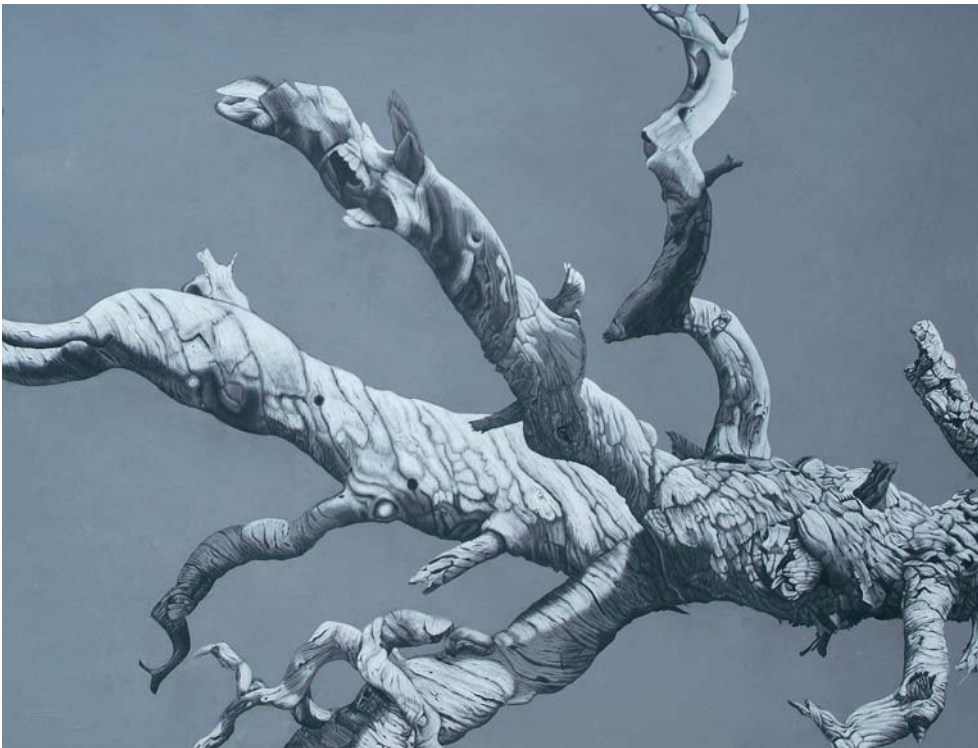
KITCHEN MESA, ACRYLIC AND GRAPHITE ON PANEL, 46 X 60"